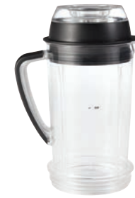
1 SouperBlast Pitcher with 2-piece Lid