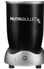
1 High-torque Power Base