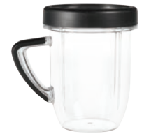
1 Short Cup with 1 Comfort Lip Ring