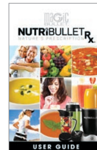
1 User Guide