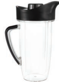
1 Oversized Cup with 1 Pitcher Lid